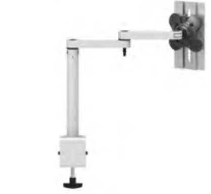
● EGL6-202 ● EGL6-302 W124xD471xH270~442mm