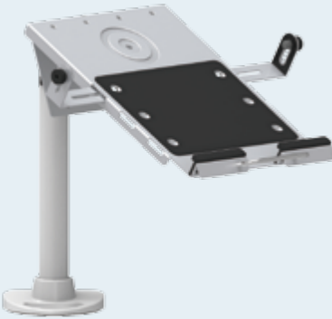
Laptop Holder EGDF-A05 (for Easyfly Series) W290~450xD375xH161

The goal of LCD monitor arm is to create optimum comfortable and healthy living and working conditions. Great care and fastidiousness are placed in the details of our designs. This LCD monitor arm reviews a number of techniques for avoiding work-related, repetitive stress injuries , long-term incorrect postures & positions and enhancing both the comfort and productivity levels of the workers who adopt them.