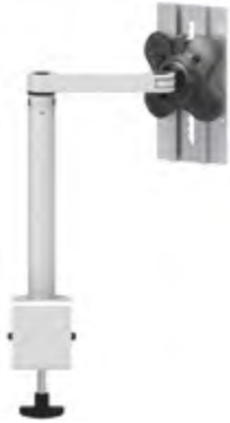
● EGL6-201 ● EGL6-301 W124xD301xH241~413mm