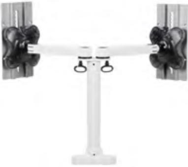
● EGL3-201D ● EGL3-301D W515xD119xH241~413mm