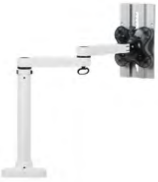
● EGL3-202 ● EGL3-302 W124xD459xH281~453mm