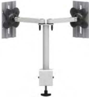
● EGL6-201D ● EGL6-301D W515xD131xH230~402mm