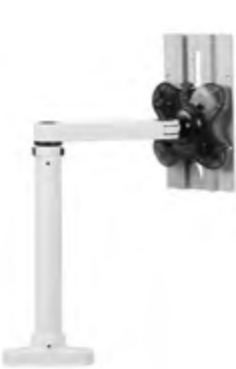
● EGL3-201 ● EGL3-301 W124xD289xH251~423mm