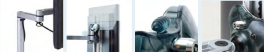
Cable management Height adjustment Quick release Anti-theft kit