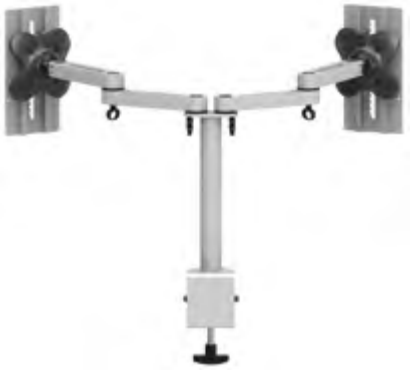
● EGL6-202D ● EGL6-302D W855xD131xH259~431mm