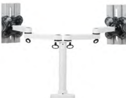
● EGL3-202D ● EGL3-302D W855xD119xH271~443mm