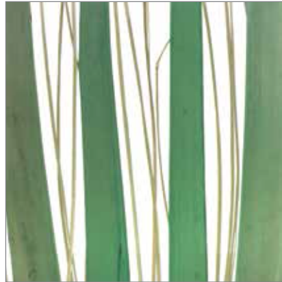
SCALE | 8"x 8" 20 x 20 cm