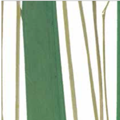
SCALE | 3 ½"x 3 ½" 9 x 9 cm