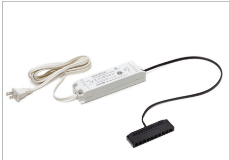
SLT30-12VL(UL) for 12Vdc LED