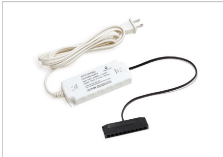
SLT15-12VF(UL) for 12Vdc LED